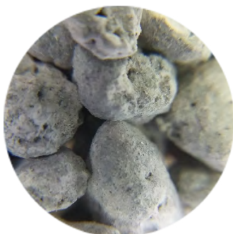
Unrefined borates (ulexite, colemanite and hydroboracite)